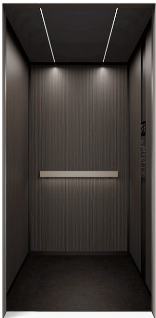
Forest a warm and rich ambience