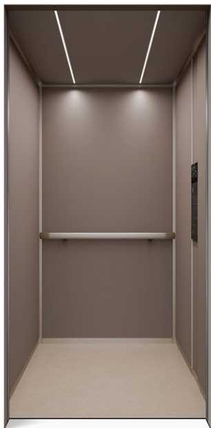
Terra a sleek and fascinating aesthetic