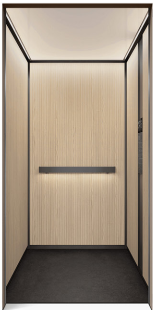
Savanna a bright and earthy space