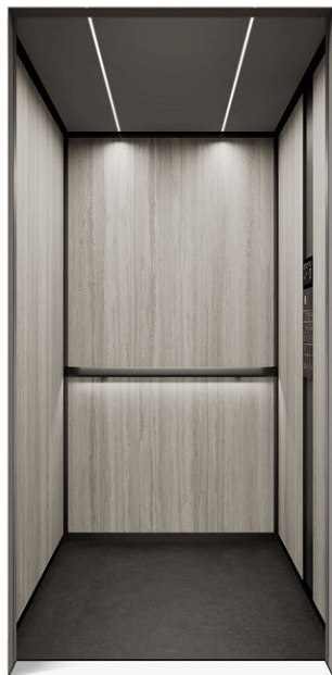
Mineral an open and natural feel