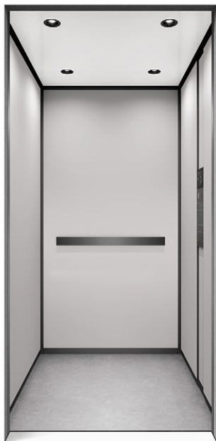
Luna a timeless and refined look