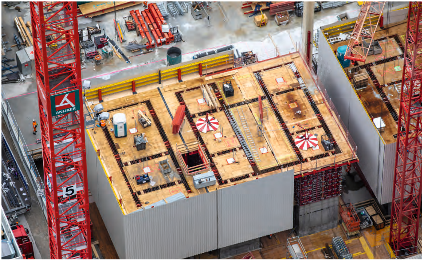
Construction site of pRED Center, Roche Site Basel, where Schindler CLIMB Lift was also applied